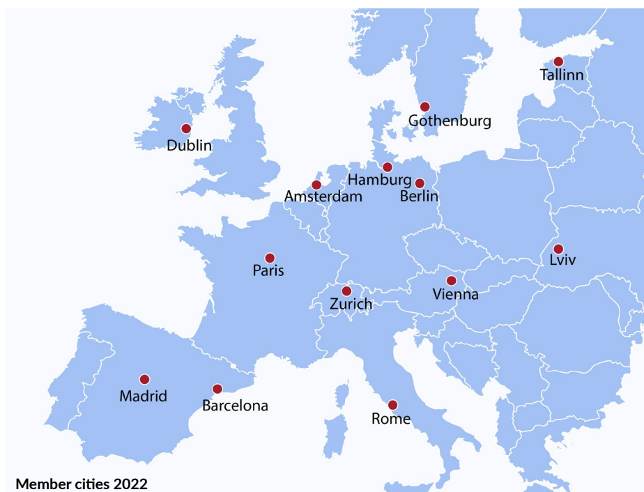
Member cities 2022