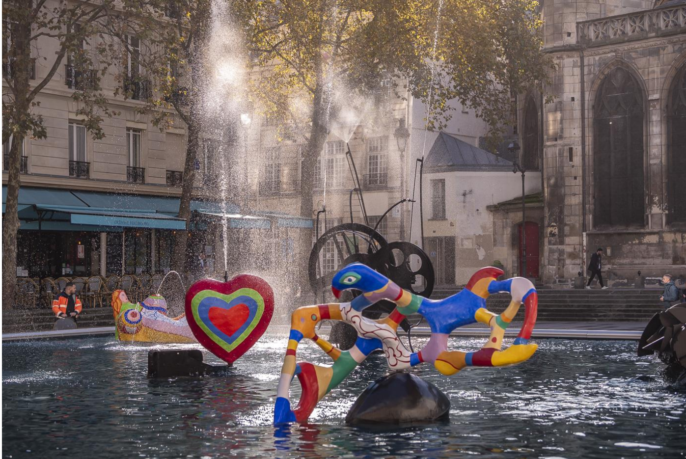
Renovation of the Stravinsky fountain thanks to the participatory budget (2018)