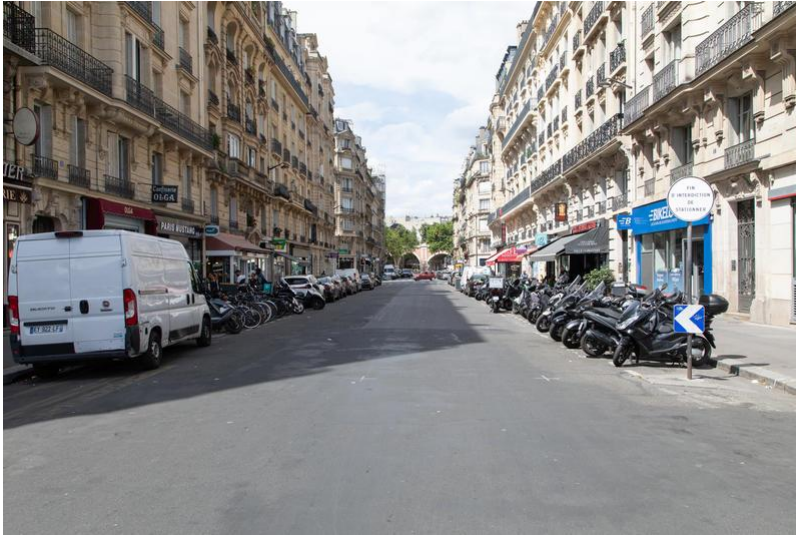
Rue Michel Chasles (12 e arrt)