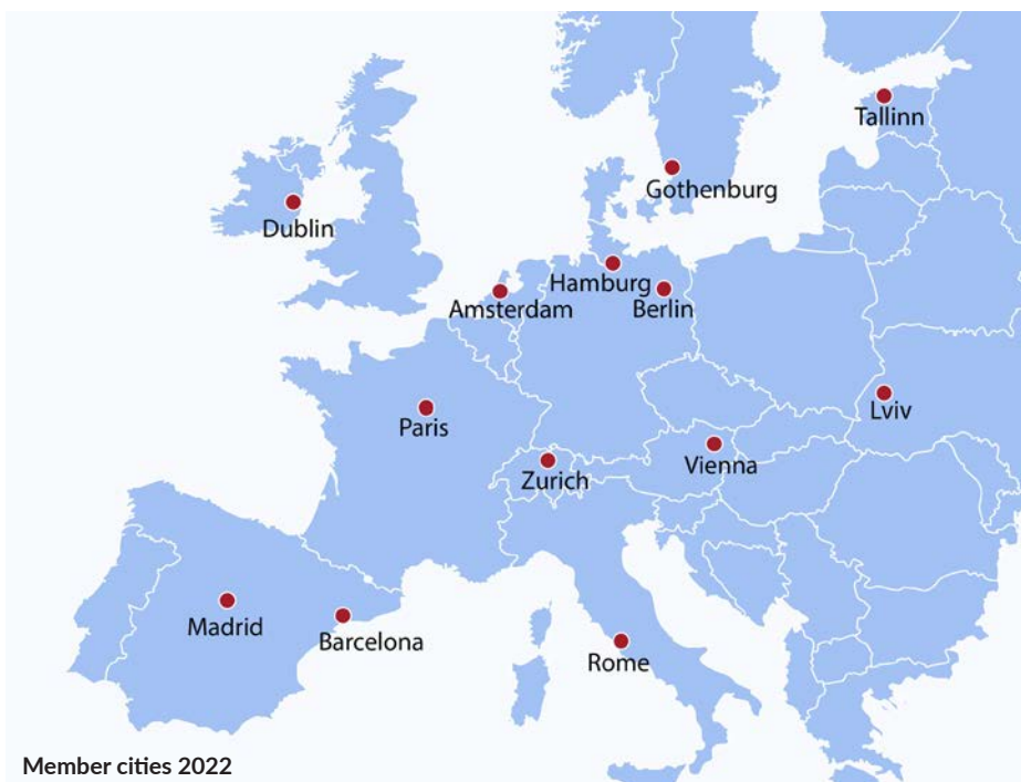
Member cities 2022