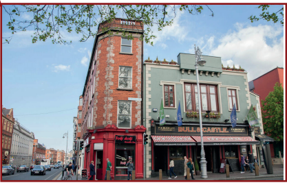
Wednesday Evening drinks reception, Bull and Castle 5-7 Lord Edward St, Dublin 2, D02 P634 (TBC)