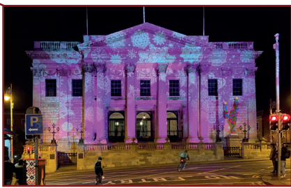
Conference Dinner Mansion House, Lord Mayor's residence, Dawson Street