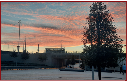
Walking Seminar - Grangegorman Technical University Dublin