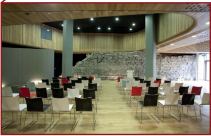
Conference Venue, Wood Quay Venue, Dublin City Council Offices (Thursday and Friday)